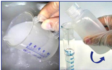
1) Sampling / Decanting