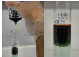
2) Adding test solution